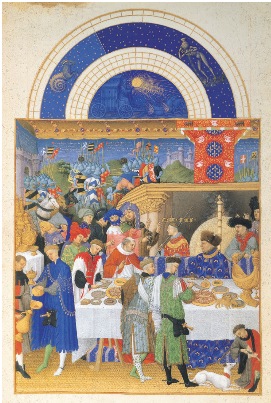
Banquet scene from Les Très Riches Heures du Duc de Berry (early 15th century) by the Limbourg brothers.