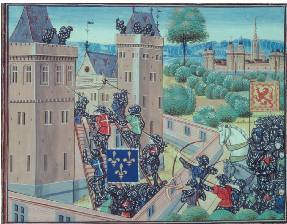
Capture of Wark Castle from the Croniques de France et d'Angleterre (1460-1480) by Jean Frossart.

With time, castles were made of rocks. 4 They were much stronger and bigger than the first castles. They had very thick walls. It was difficult for the enemy to attack this type of castle. Castles were