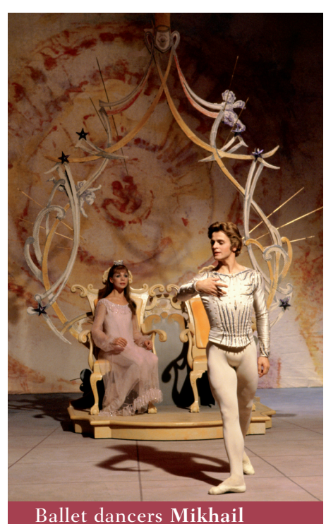
Ballet dancers Mikhail Baryshnikov and Gelsey Kirkland perform in The Nutcracker.