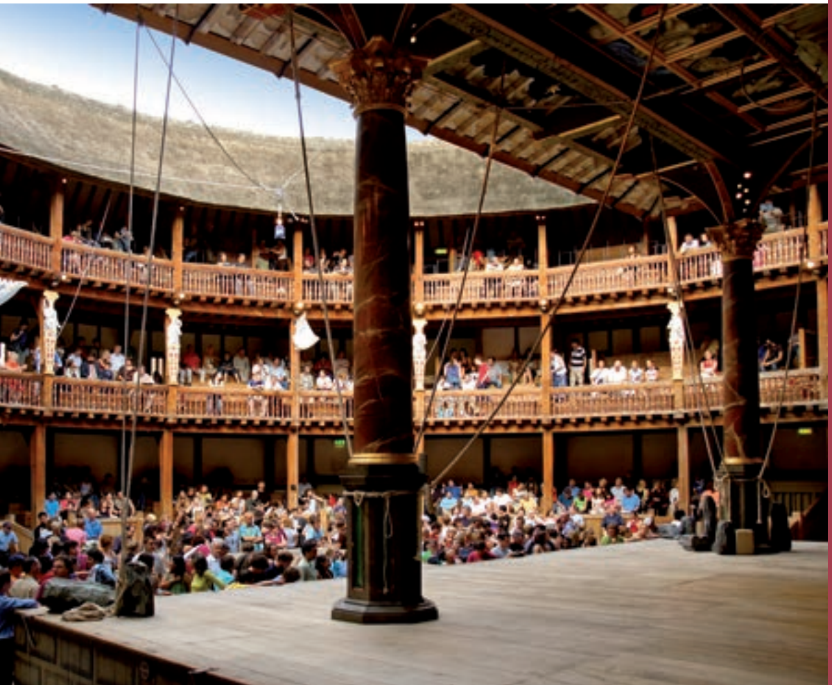
The Globe Theatre today.

Shakespeare's favourite theatre was The Globe, which burned down in 1613. In 1996, some people in London built a copy of this theatre. They built this copy at the same place where the old Globe stood, and it is just like the old theatre. Go and see a play there when you are in London!