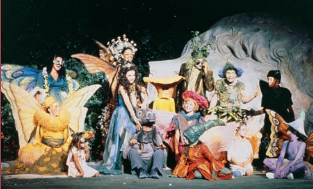
Scene from a British theatre production of A Midsummer Night's Dream .